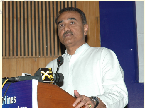
Hon'ble Minister Mr. Praful Patel Addressing Guild Seminar