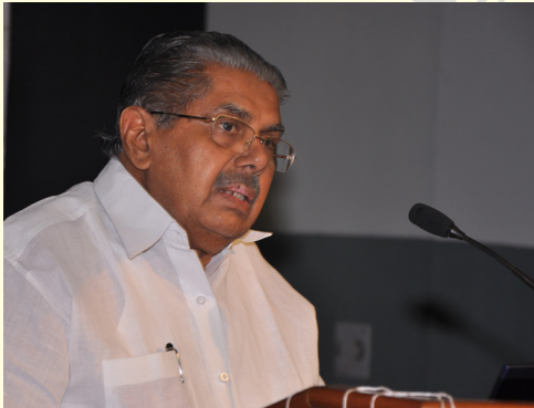
Hon'ble Minister Mr. Vayalar Ravi Addressing Guild Seminar